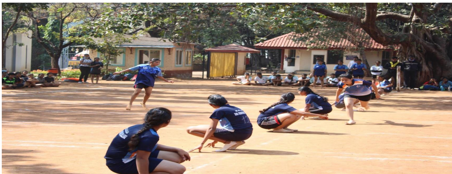
Inter College Kho-Kho Competition