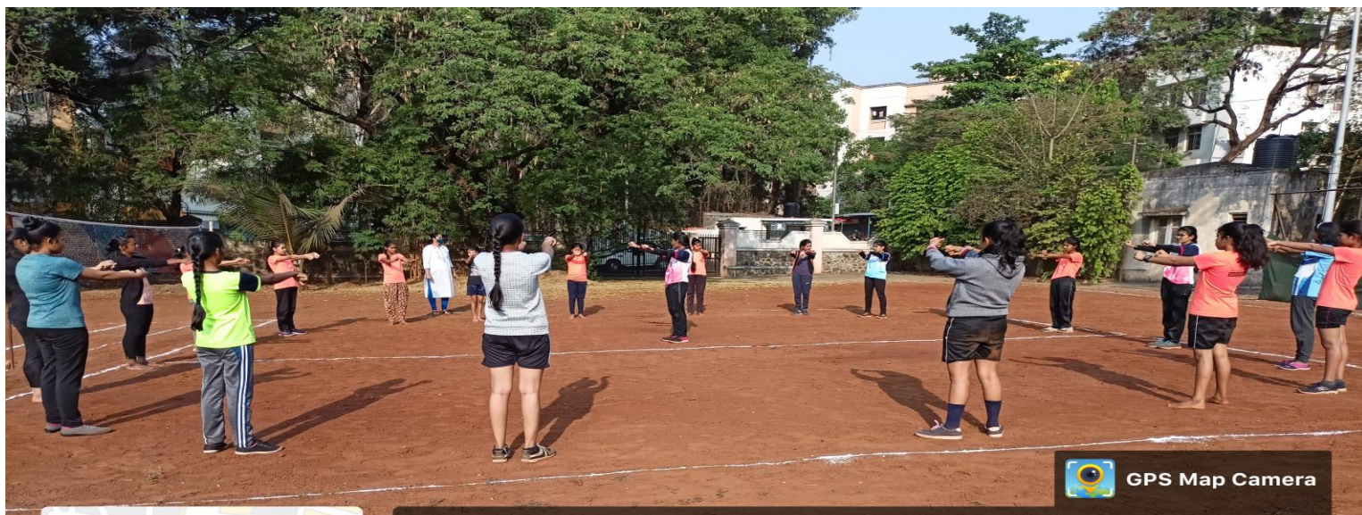
Ball Badminton Coaching Camp