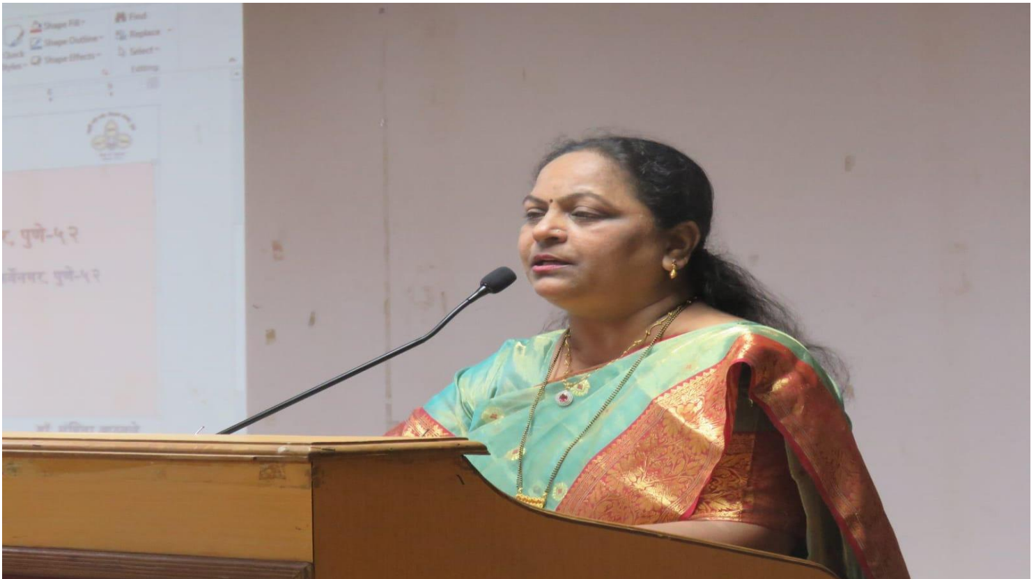
Nirbhay Kanya Abhiyan