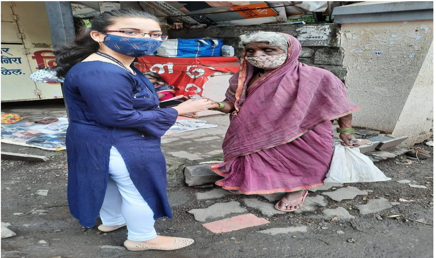
Sanitizer Distribution- in Corona by NSS