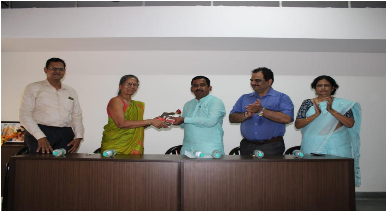
MoU Handover Ceremony