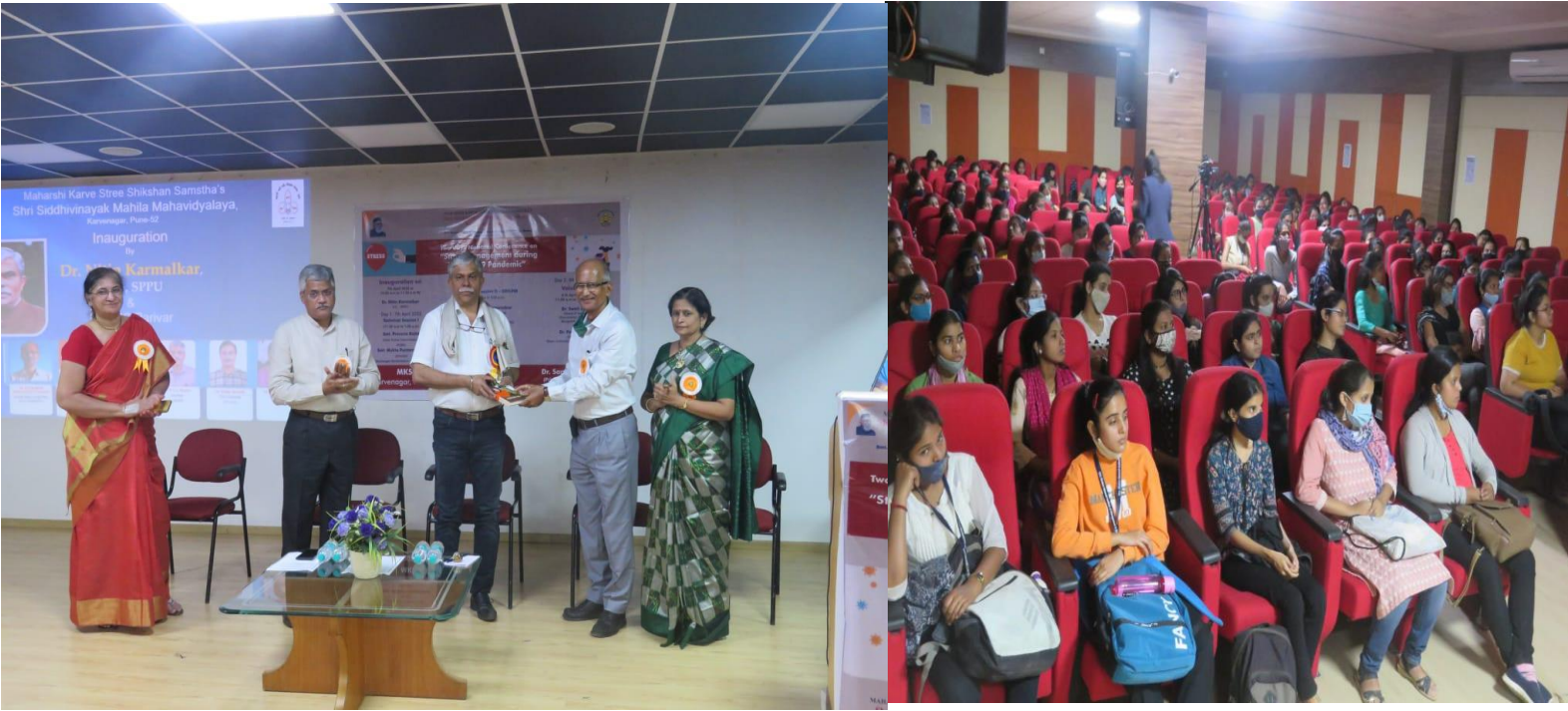
National Conference on ‘Stress Management during COVID 19 pandemic’