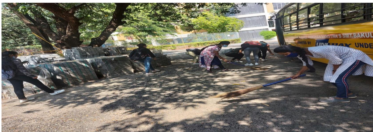
Swachhata Abhiyan by NSS