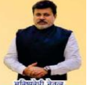
मविष्यवेधी नेतृत्व मा. उदय सामंत

उच्च व तंत्र शिक्षण मंत्री, महाराष्ट्र राज्य