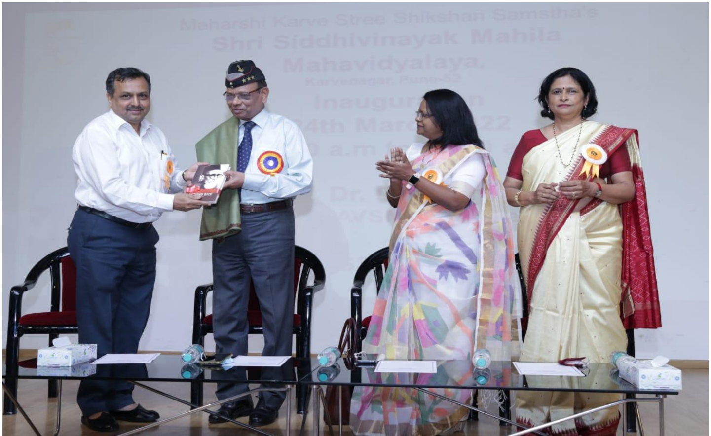
National Conference on ‘Socio-Economic changes & its impact on Widows in 21 st century’